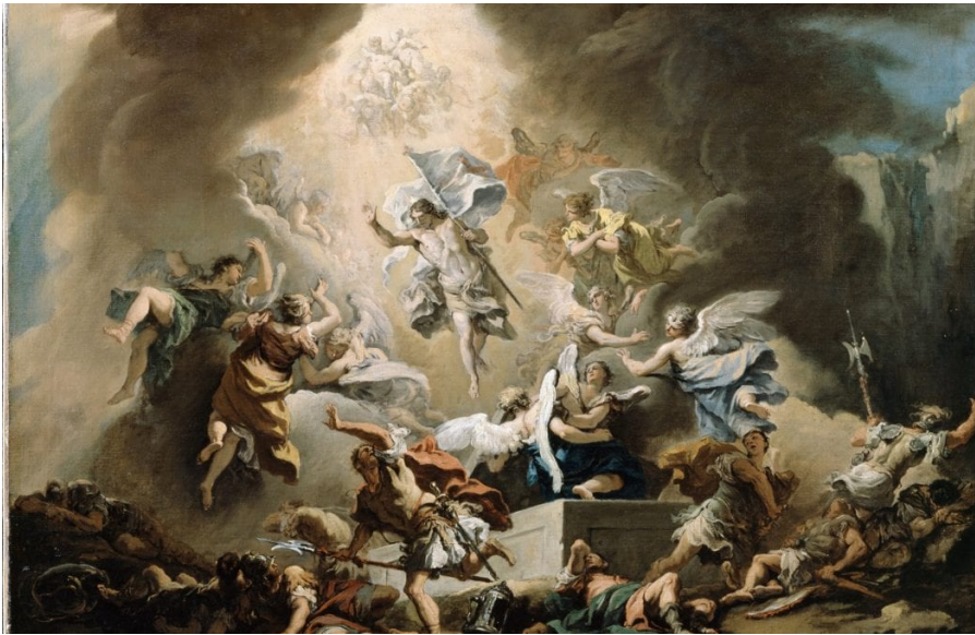
The Mystical City of God by Venerable Mary of Agreda

The sacred wounds, which had disfigured his body, now shone forth from his hands and feet and side so refulgent and brilliant, that they added a most entrancing beauty and charm. In all this glory and heavenly adornment the Savior now arose from the grave; and in the presence of the saints and Patriarchs He promised universal resurrection in their own flesh and body to all men, and that they moreover, as an effect of his own Resurrection, should be similarly glorified. As an earnest and as a pledge of the universal resurrection, the Lord commanded the souls of many saints there present to reunite with their bodies and rise up to immortal life. Immediately this divine command was executed, and their bodies arose, as is mentioned by saint Matthew, in anticipation of this mystery. Among them was saint Anne, saint Joseph and saint Joachim, and others of the ancient Fathers and Patriarchs, who had distinguished themselves in the faith and hope of the Incarnation, and had desired and prayed for