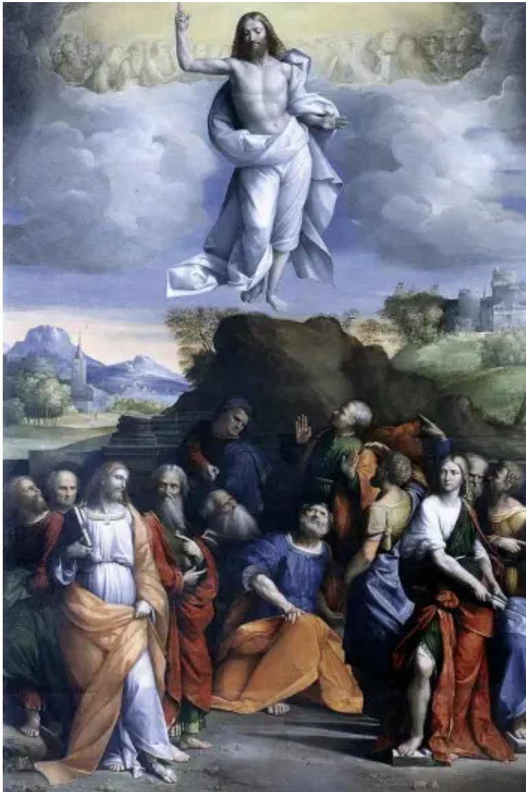
The Ascension of Christ - Garofalo, 1515