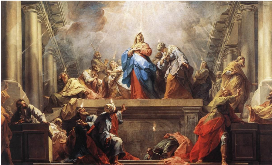
Pentecost - Jean Restout, 1732