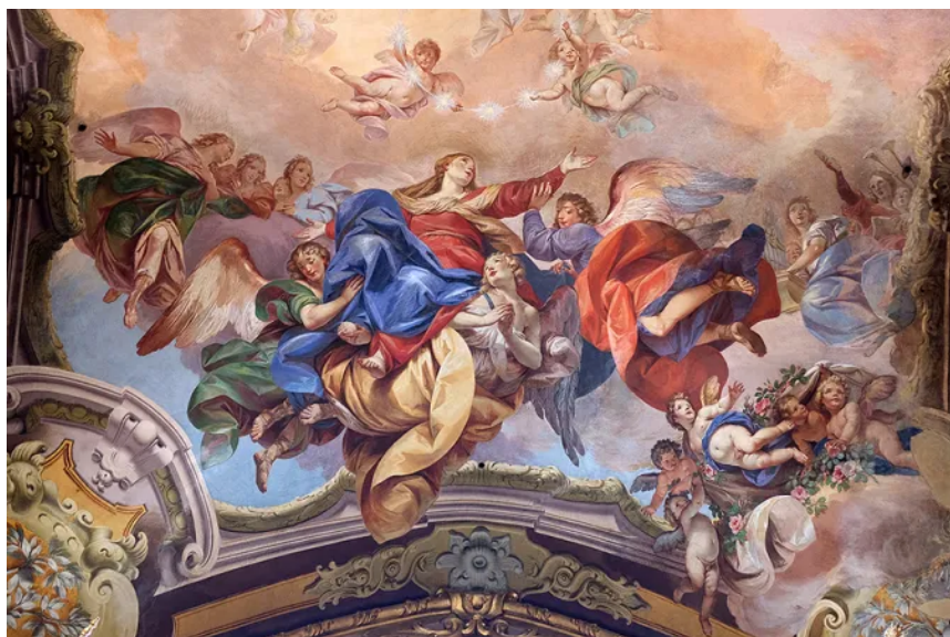
Assumption of the Virgin Mary - San Petronio Basilica in Bologna, Italy