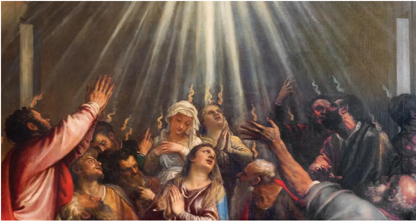
The Mystical City of God by Venerable Mary of Agreda

On Pentecost morning the blessed Virgin Mary exhorted the Apostles, the disciples and the pious women, numbering about one hundred and twenty, to pray more fervently and renew their hopes, since the hour was at hand in which they were to be visited by the divine Spirit from on high. At the third hour (nine o'clock), when all of them were gathered around their heavenly Mistress and engaged in fervent prayer, the air resounded with a tremendous thunder and the blowing of a violent wind mixed with the brightness of fire or lightning, all centering upon the house of the Cenacle. The house was enveloped in light and the divine fire was poured out over all of that holy gathering. Over the head of each of the hundred and twenty persons appeared a tongue of that same fire, in which the Holy Ghost had come, filling each one with divine influences and heavenly gifts and causing at one and the same time the most diverse and contrary effects in the Cenacle and in the whole of Jerusalem, according to the diversity of the persons affected.