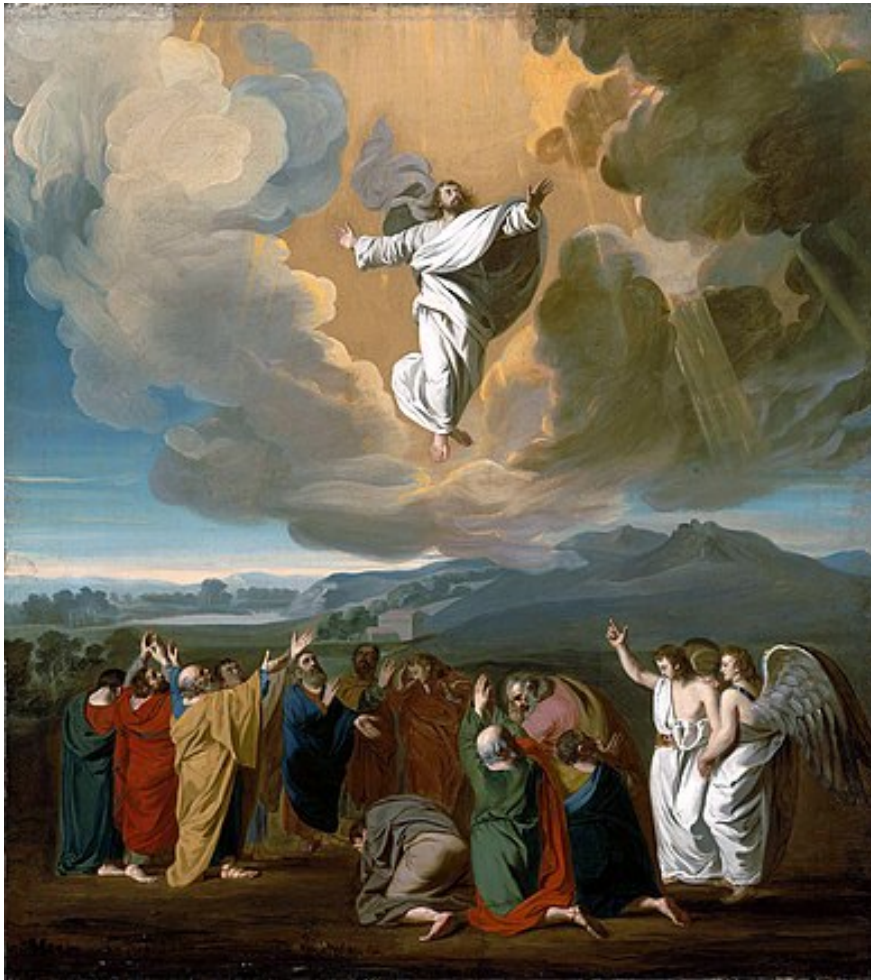
Ascension - John Singleton Copley, 1775