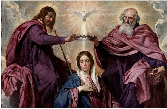
Coronation of the Virgin - Diego Velázquez