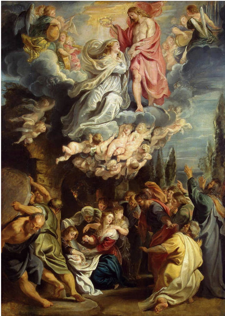
Ascension and Coronation of the Virgin - Peter Paul Rubens