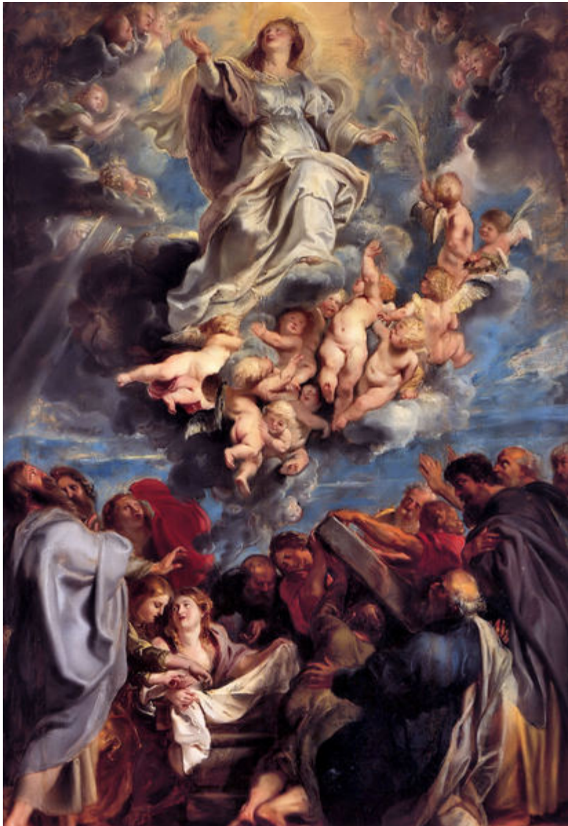
Assumption of the Divine and Holy Virgin Mary - Peter Paul Rubens