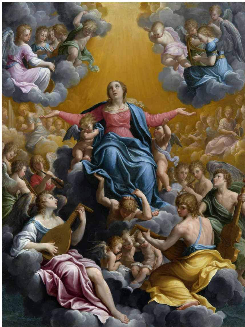
Assumption Of The Virgin - Guido Reni