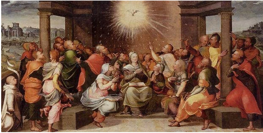
Descent of the Holy Spirit at Pentecost - Lambert Lombard, 1558