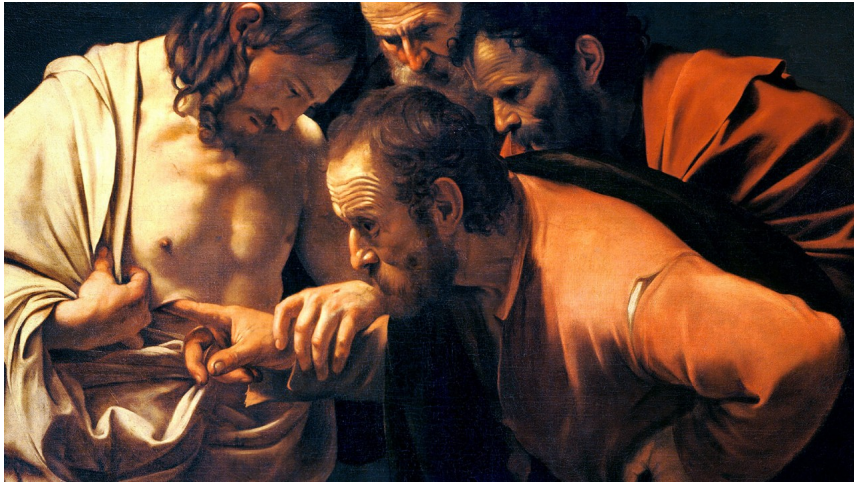
The Annunciation - Bozhena Fuchs, 2021