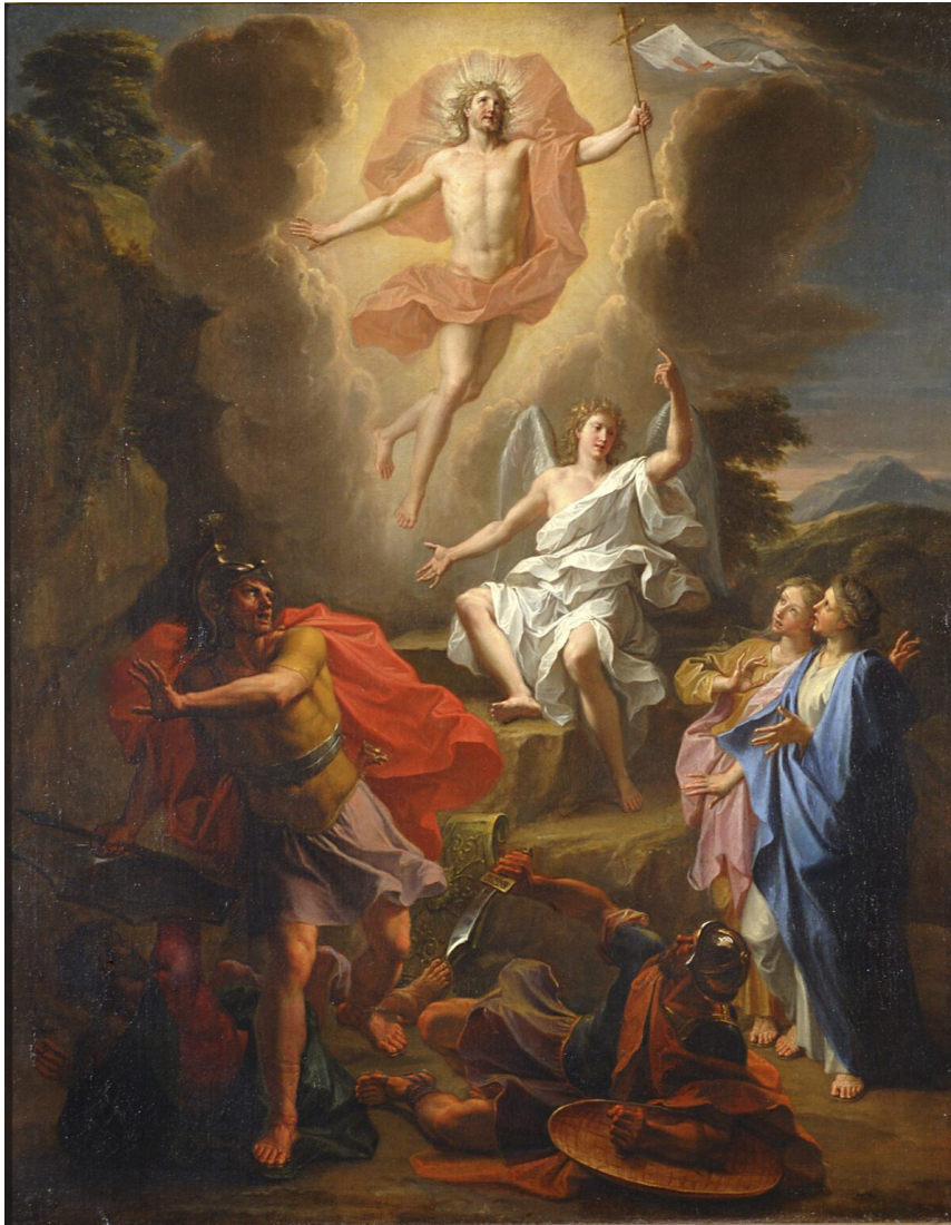
Resurrection of Christ - Noël Coypel, 1700