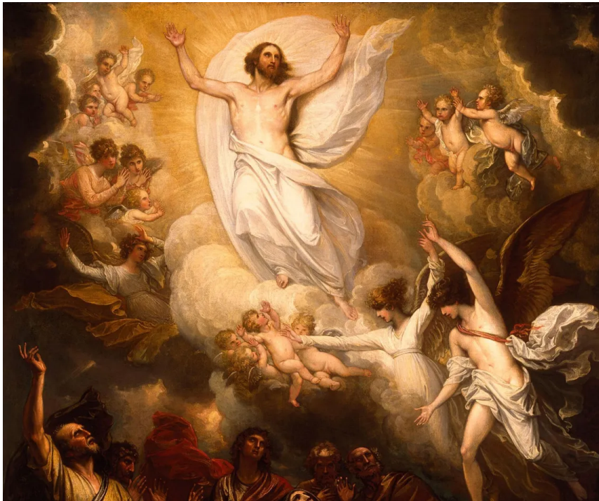
The Ascension - Benjamin West, 1801