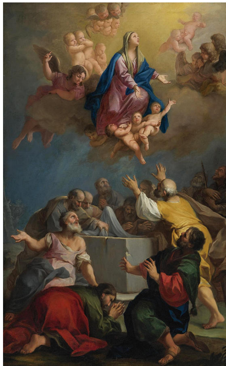
The Assumption of the Virgin - Jacopo Amigoni

Amid this glory the most blessed Mary arrived body and soul at the throne of the most blessed Trinity. And the three divine Persons received Her on it with an embrace eternally indissoluble. There the most blessed Mary was absorbed in the contemplation of the three divine Persons and as it were overwhelmed in the boundless ocean and abyss of the Divinity, while the saints were filled with wonder and new accidental delight.