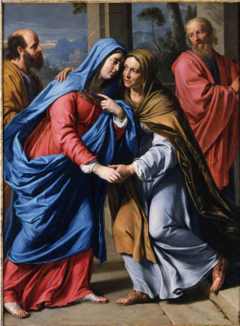
The Visitation - Philippe de Champaigne, 1643–48

In those days Mary arose and went with haste into the hill country, to a city of Judah, and she entered the house of Zechariah and greeted Elizabeth. And when Elizabeth heard the greeting of Mary, the babe leaped in her womb; and Elizabeth was filled with the Holy Spirit and she exclaimed with a loud cry, "Blessed are you among women, and blessed is the fruit of your womb! And why is this granted me, that the mother of my Lord should come to me? For behold, when the voice of your greeting came to my ears, the babe in my womb leaped for joy. And blessed is she who believed that there would be a fulfillment of what was spoken to her from the Lord."