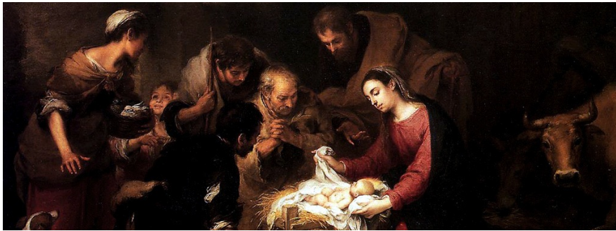
The Birth of Jesus - Renaissance