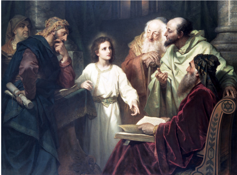
Jesus in the Temple - Heinrich Hofmann, 1881