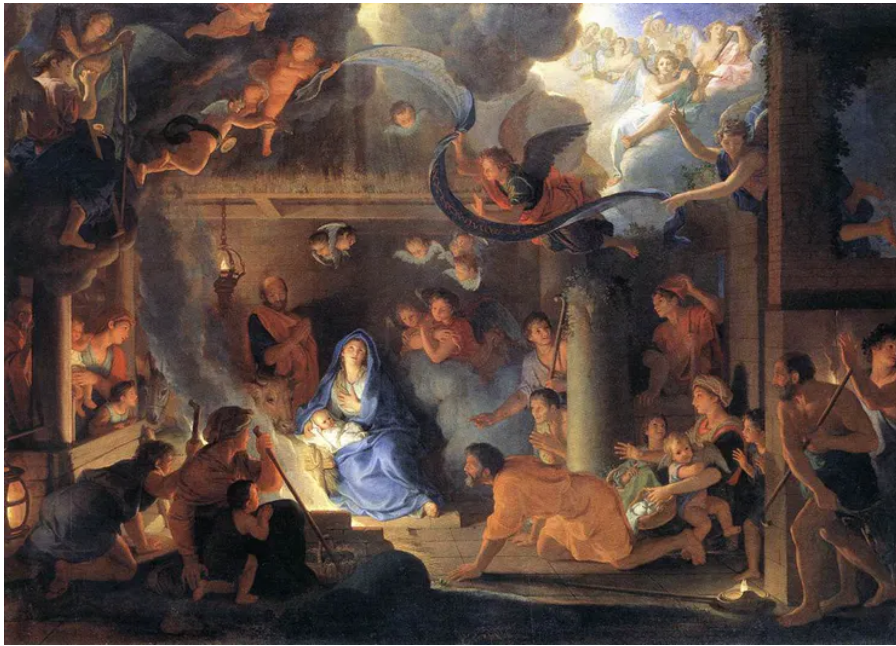
In Adoration of the Shepherds - Charles Le Brun, 1689