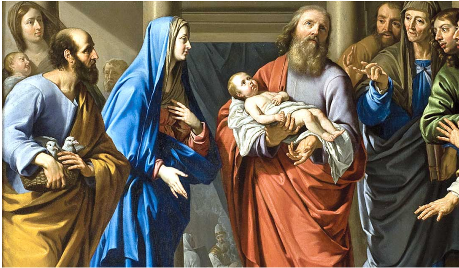
The Presentation of the Christ Child in the Temple Phillippe de Champaigne, 1648