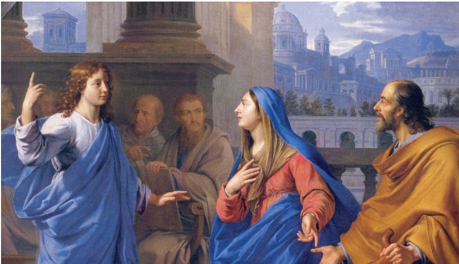
The Mystical City of God by Venerable Mary of Agreda

The Mother of wisdom then began to discuss within her heart the different possibilities. The first thought which presented itself to Her, was the fear lest Archelaus, imitating the cruelty of his father Herod, should have obtained notice of the presence of Jesus and have taken Him prisoner. Although She knew from the holy Scriptures and revelations, and by her conversations with her most holy Son and Teacher, that the time for his Passion and Death had not yet come and that the king would not take away his life, yet She was filled with dread at the thought, that they should have taken Him prisoner and might illtreat Him. In her profoundest humility She also had misgivings, lest perchance She had in any way displeased Him by her conduct and therefore deserved that He should leave Her and take up his abode in the desert with his precursor saint John. She exclaimed: "Sweet Love and Delight of my soul!"