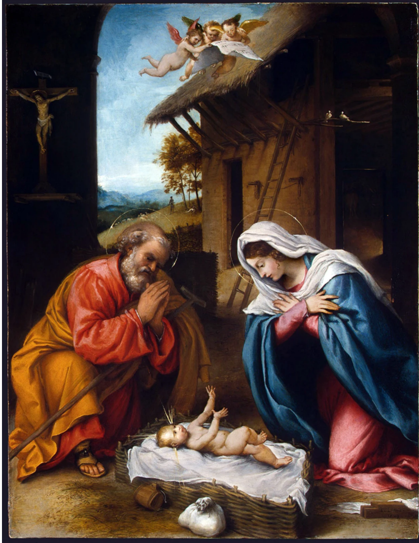
The Nativity - Lorenzo Lotto, 1523