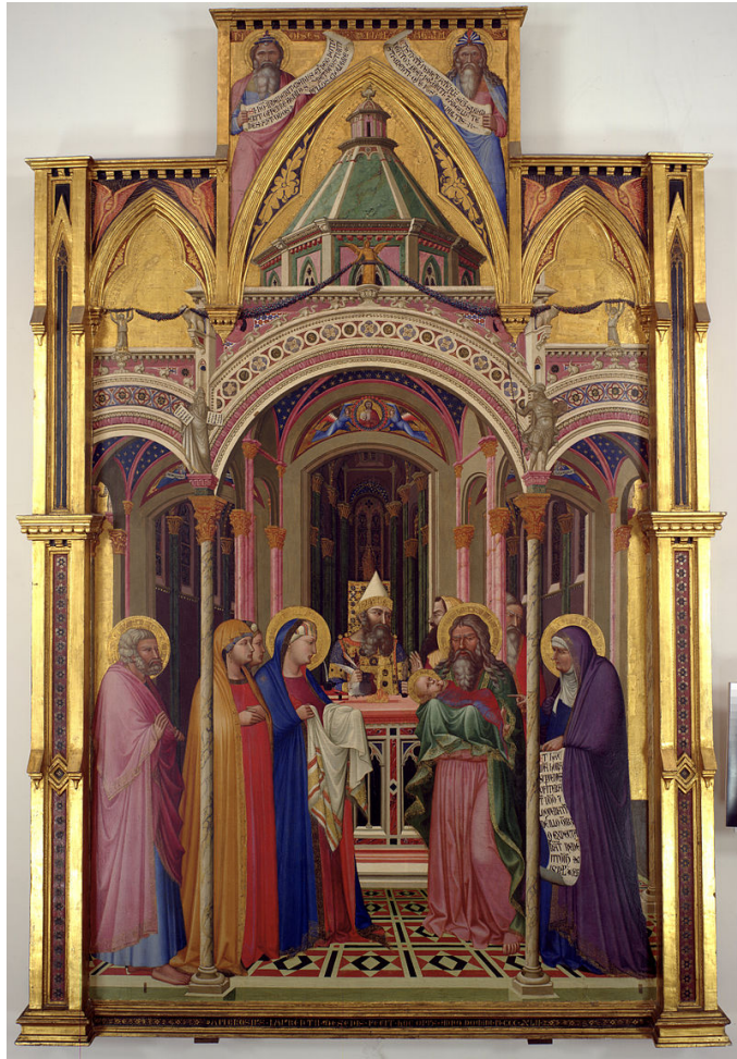
The Mystical City of God by Venerable Mary of Agreda

On the next morning, the Sun of heaven being now ready to issue from its purest dawning, the Virgin Mary, on whose arms He reclined, and being about to rise up in full view of the world, the heavenly Lady, having provided the turtle-dove and two candles, wrapped Him in swaddling-clothes and betook Herself with saint Joseph from their lodging to the temple.