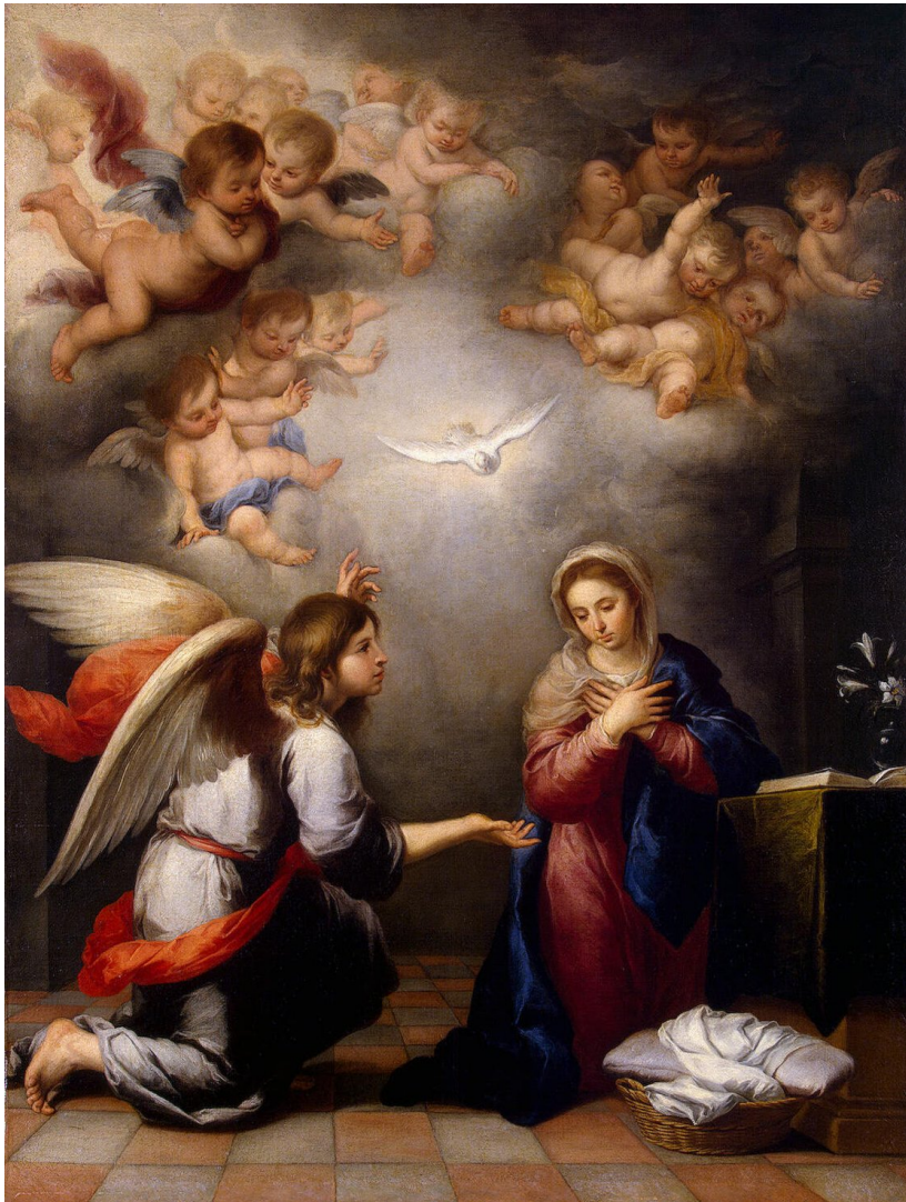
The Annunciation - Murillo, 1655–1660