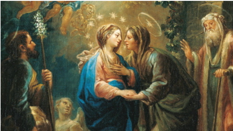
The Visitation - Jerónimo Ezquerro