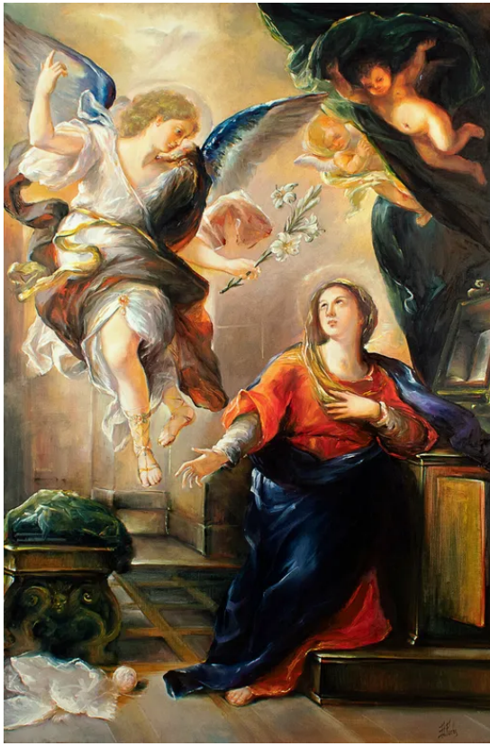
The Annunciation - Bozhena Fuchs, 2021