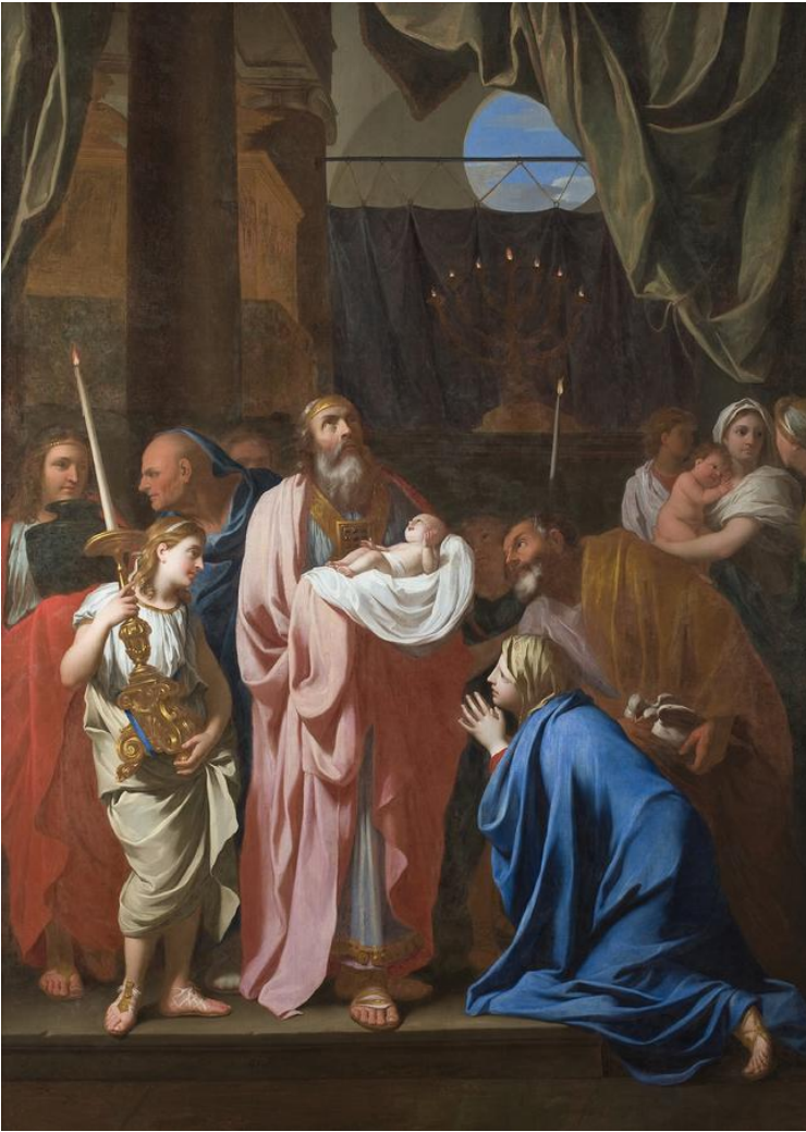
The Presentation of Christ the Temple - by Charles Le Brun