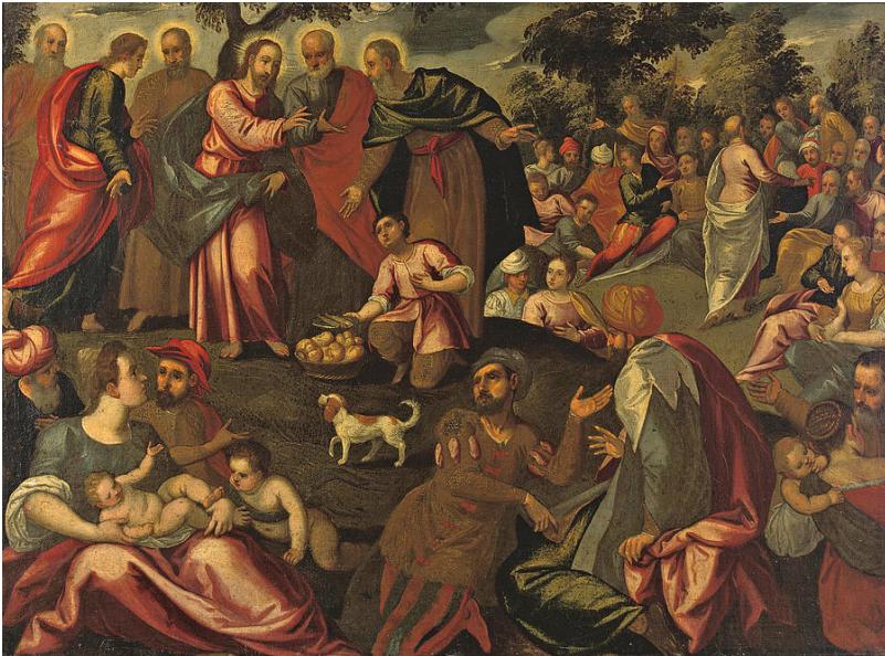
Christ preaching to the Multitudes - Tintoretto