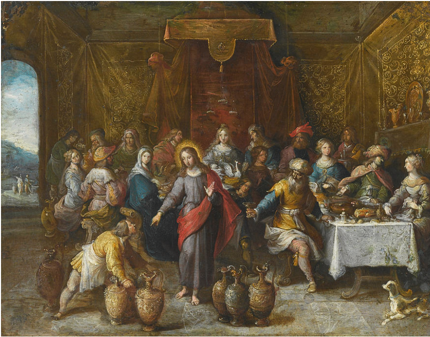
The Marriage Feast at Cana - Frans Francken the Younger