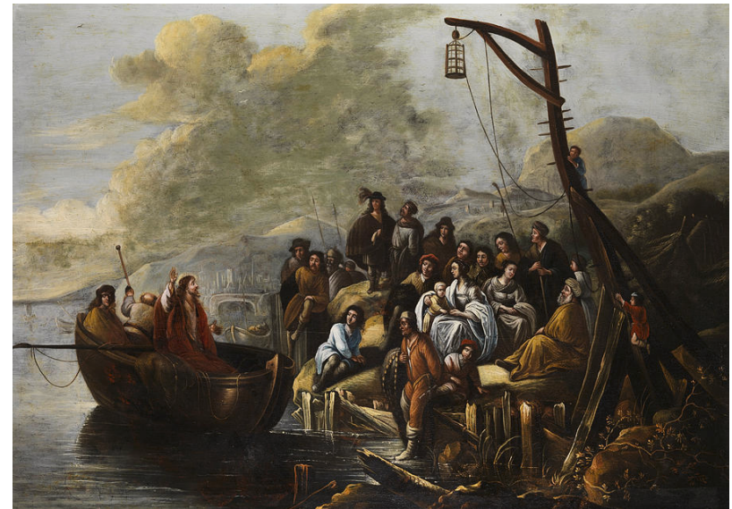
Jesus Preaches at the Sea of Galilee - Gerbrand van den Eeckhout

Savior of the world. She also knew the interior of those that listened to the preaching of the Lord, their state of grace or sin, their vices and virtues. This various and hidden knowledge, so far above the capacity of men, caused in the heavenly Mother many wonderful effects of highest charity and other virtues; it inflamed Her with zeal for the Honor of the Lord and with ardent desires, that the fruits of the Redemption be not lost to the souls through sin moved Her to exert Herself in the most fervent prayer for their welfare. She felt in her heart a piercing and cruel sorrow, that God should not be known, adored and served by all his creatures: and this sorrow was in proportion to the unequalled knowledge and understanding She had of all these mysteries. For the souls, that would not give entrance to divine grace and virtue, She sorrowed with ineffable grief, and was wont to shed tears of blood at the thought of their misfortune. What the great Queen suffered in this her solicitude and in her labors exceeds beyond all measure the pains endured by all the martyrs of the world.