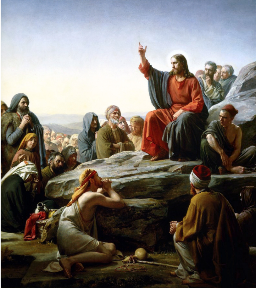
Sermon on the Mount - Carl Bloch, 1877