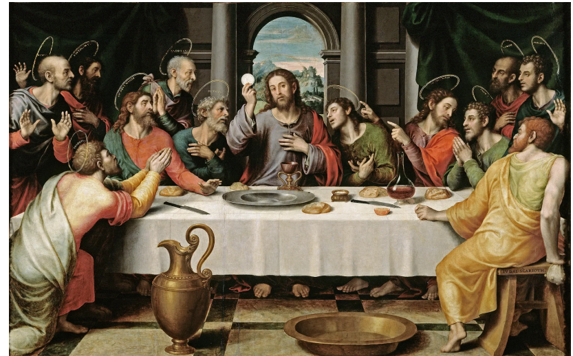
The Last Supper - Joan de Joanes, 1562

In the species of the bread, was contained his body and in those of the wine, his blood; in both, on account of the inseparable union of his soul with his body and blood, was present the living and true Christ; with the Person of the Word, was also therein united the Person of the Father and of the Holy Ghost; and therefore, on account of the inseparable existence and union of the Father, Son and Holy Ghost, the holy Eucharist contained the perfect humanity of the Lord with the three divine Persons of the Godhead.