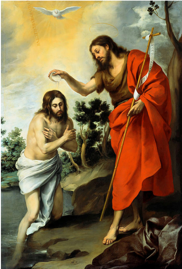
The Baptism of Christ - Bartolome Esteban Murillo