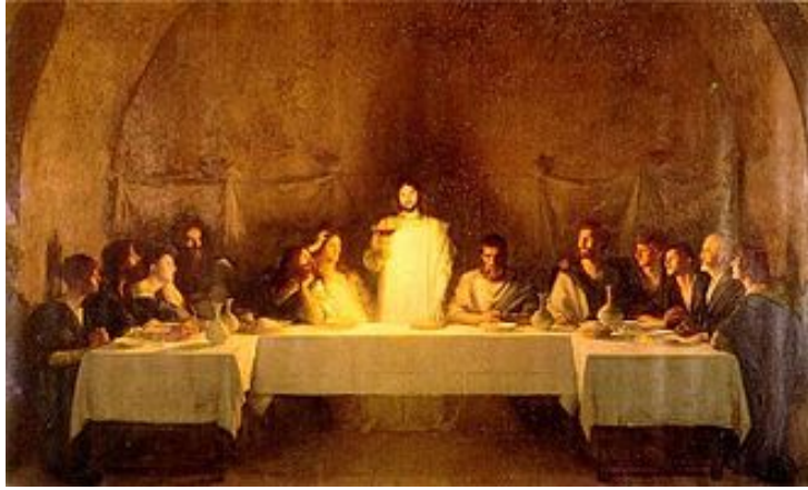
The Last Supper - Bouveret, 1896