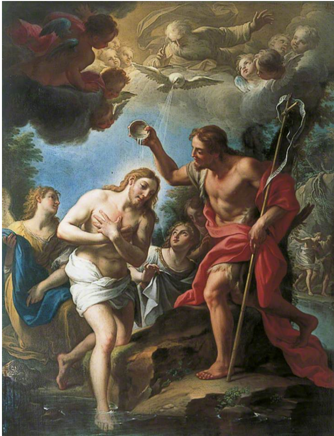
The Baptism of Christ - Francesco Trevisani