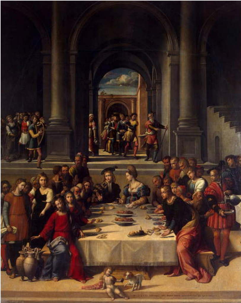
The Wedding Feast at Cana - Benvenuto Tisi da Garofalo