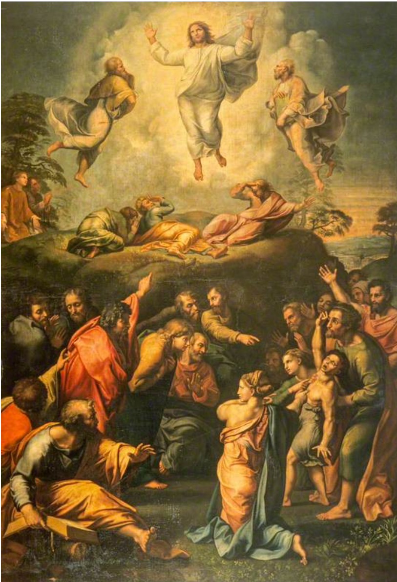
The Transfiguration - Raphael, 1520