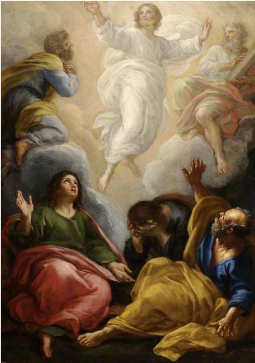
The Transfiguration - Giacinto Calandrucci